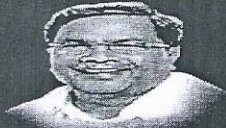
Sri Siddaramalah Hon'ble Chief Minister of Karnataka.