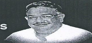
Sri Tanveer Sait Hon'ble Minister for Minorities Welfare, Wakf, Primary & Secondary Education

MUSLIMS CHRISTIANS JAINS SIKHS BUDDHISTS PARSIS