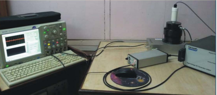
Experimental facility: Pulsed Electro-Acoustic Technique for space charge measurement in polymers.

for prediction of ageing and breakdown in insulating materials, in terms of space charge dynamics.