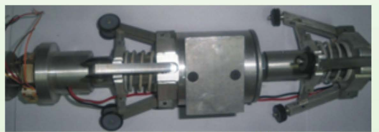
The proposed New Robot based on PVDF Sensor

the usability of a new PVDF based cantilever smart probe as a sensor to sense finite sized discontinuities over a surface using the pipe crawler robot. It is envisaged that this novel sensing system could be used effectively for pipe health monitoring.