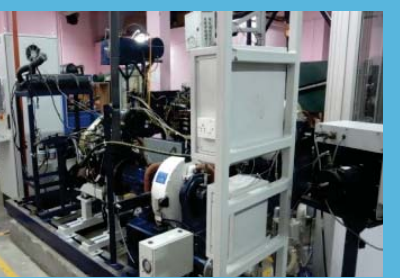
Two Cylinder Engine with Eddy Current Dynamometer