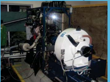
TATA Dicor 2.2L Engine