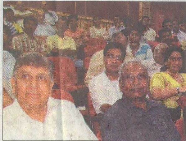
■ (Above) Professors and students listening in rapt attention at a Golden Jubilee function at Indian Institute of Technology-Kanpur on Sunday and (Right) Chairman of National Knowledge Commission Sam Pitroda addressing the audience through video conferencing during a workshop on higher education at IIT-K on Sunday.